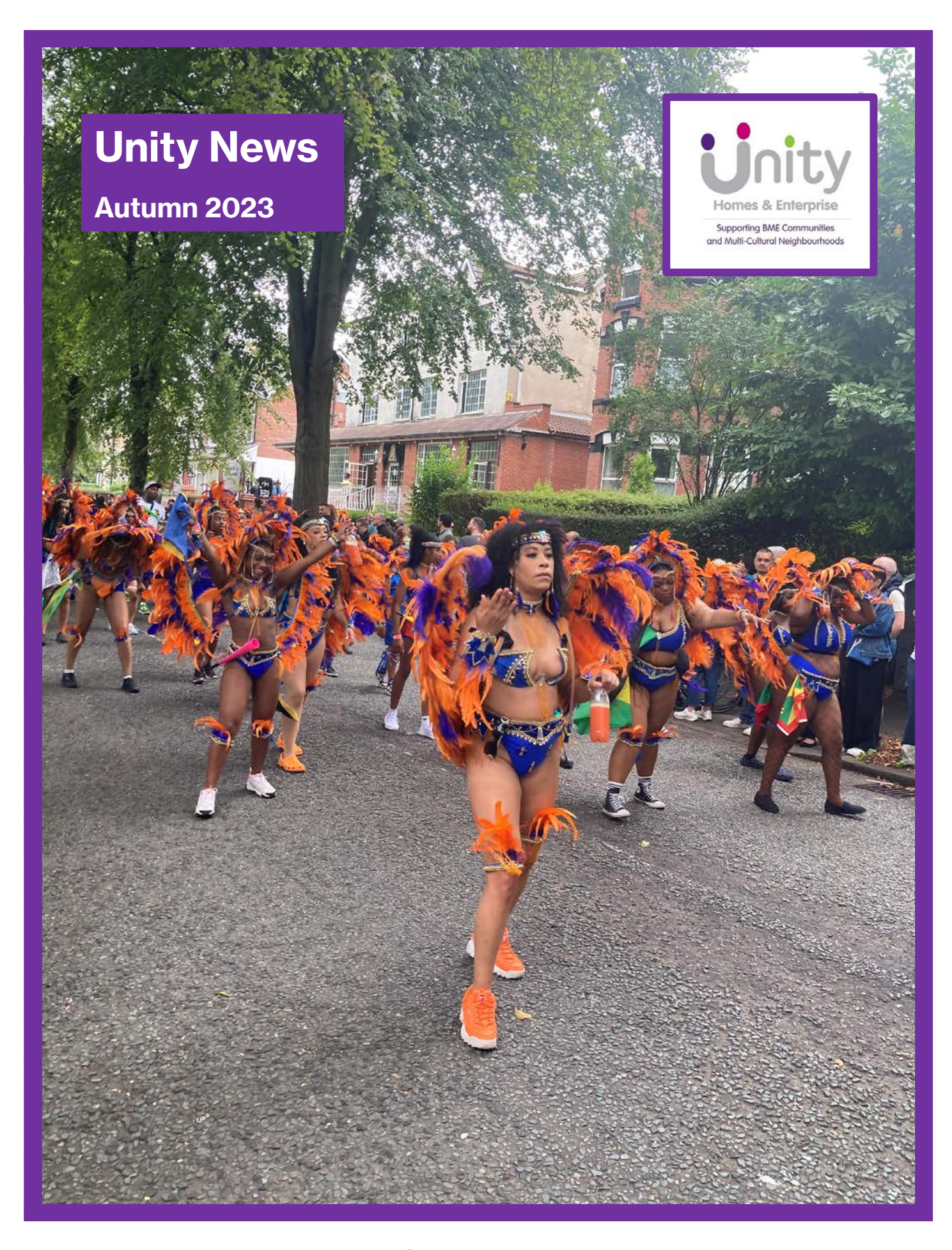
Leeds West Indian Carnival comes to the streets of Chapeltown and Harehills